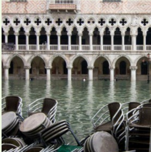
Floods & Cloudbursts