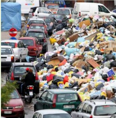
The Waste Crisis