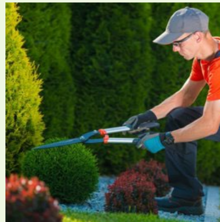
New Employment Opportunities